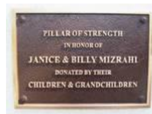
12 x 12 Bench Plaque

Purchase online at www.mpmamemorial.com or fill out and mail the included Purchase Form .